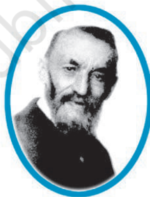
G. Peano (1858-1932)

In contrast to deduction, inductive reasoning depends on working with each case, and developing a conjecture by observing incidences till we have observed each and every case. It is frequently used in mathematics and is a key aspect of scientific reasoning, where collecting and analysing data is the norm. Thus, in simple language, we can say the word induction means the generalisation from particular cases or facts.